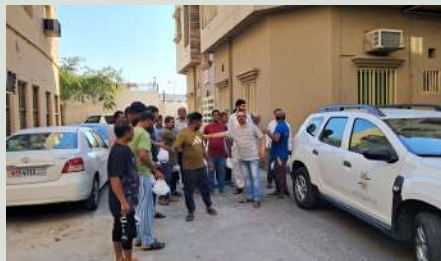
Food donated by the Sri Sathya Sai Global Council, in collaboration with MWPS, benefited 51 jobless and low-salaried individuals.