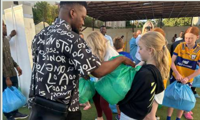
45 dry ration bags were distributed to jobless and low-paid individuals.